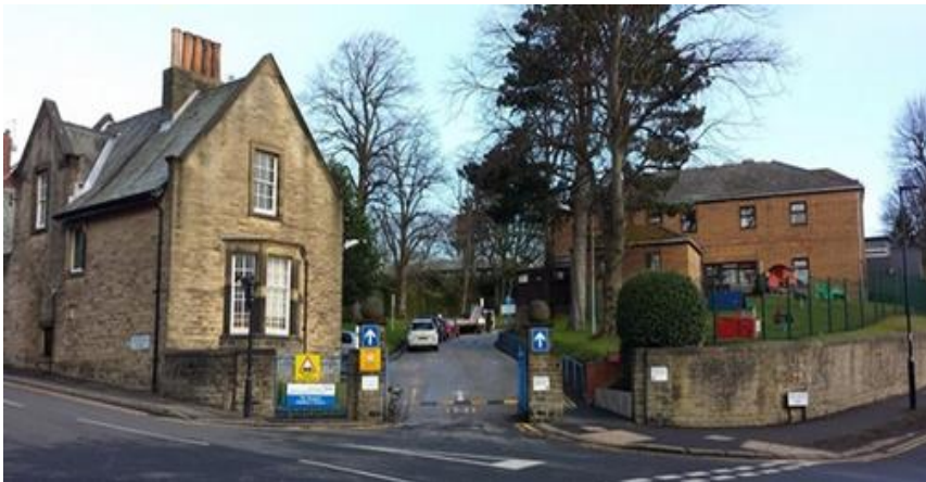
Ryegate Children's Centre

I am going for a Ryegate assessment appointment. This might be at Ryegate Children's Centre. It might be at Centenary House. My parents or carers will know where the appointment is. My parents or carers will come with me.