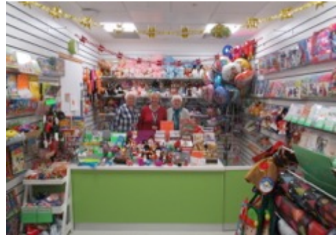
The new shop!

Our volunteers really enjoy working in the new space and we have had many positive comments from patients, parents and staff.