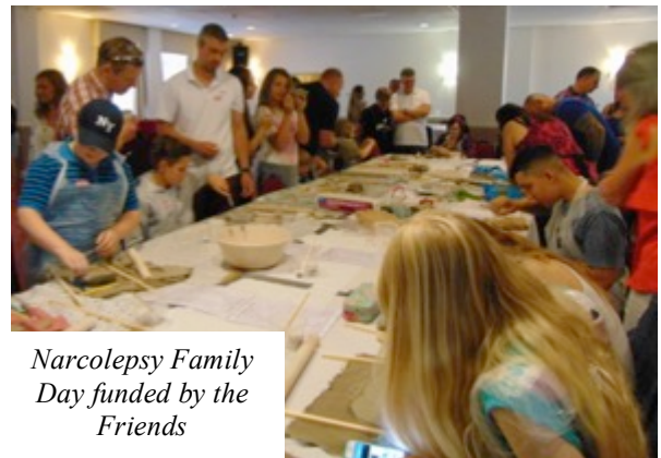
Narcolepsy Family Day funded by the Friends