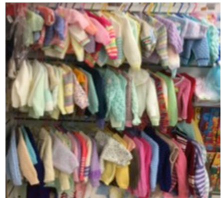
The display of hand knitted items