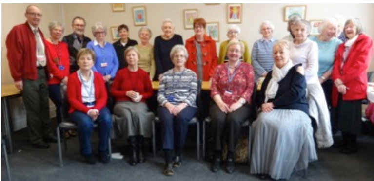
Some of our shop volunteers

We are fortunate to have many supporters who donate knitted items and other goods to sell in the shop, which helped to raise money for the Friends. This year the knitting alone has raised in excess of £3,000 . A huge thank you to you all