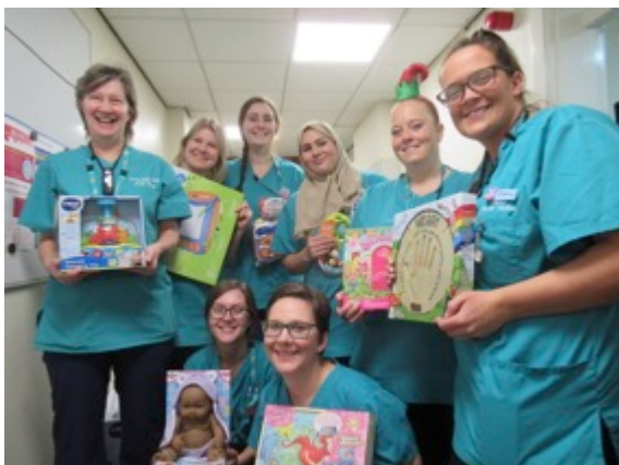
Staff with some of the Christmas toys for the Wards donated by the Friends