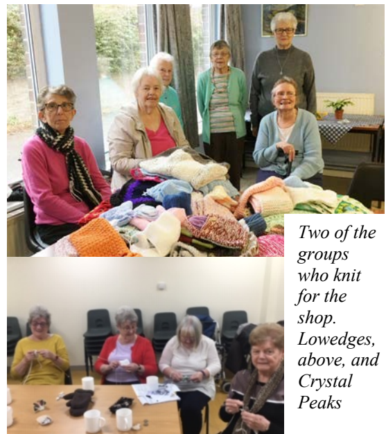
Two of the groups who knit for the shop. Lowedges, above, and Crystal Peaks