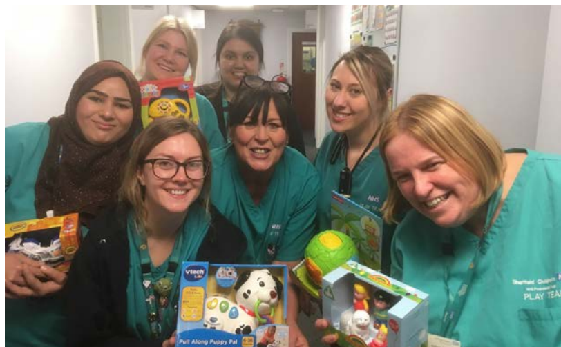
Staff with some of the Christmas toys for the Wards donated by the Friends

The staff have told us, "It's great to see the patients accessing the books and chilling out having a read."