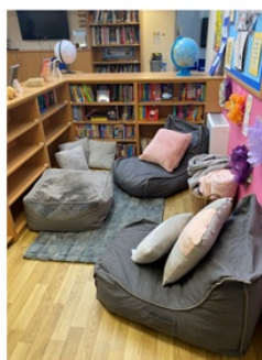
Refurbished library at the Becton Centre in Beighton financed by the Friends.

The staff have told us, "It's great to see the patients accessing the books and chilling out having a read."