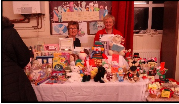
Grenoside Brightholmelee Methodist Church Christmas Tree Festival made £1460. £460 from our stands plus a very generous £1000 from the church