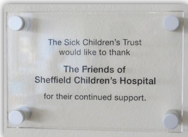
Plaque placed in Treetops House this year