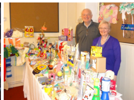
Brightholmlee Methodist Church, Wharncliffe Side held its second a Christmas Tree Festival. We received a generous donation of £1,000 from the proceeds, and our stall at the event raised a further £220. Our thanks go to everybody at Brightholmlee.