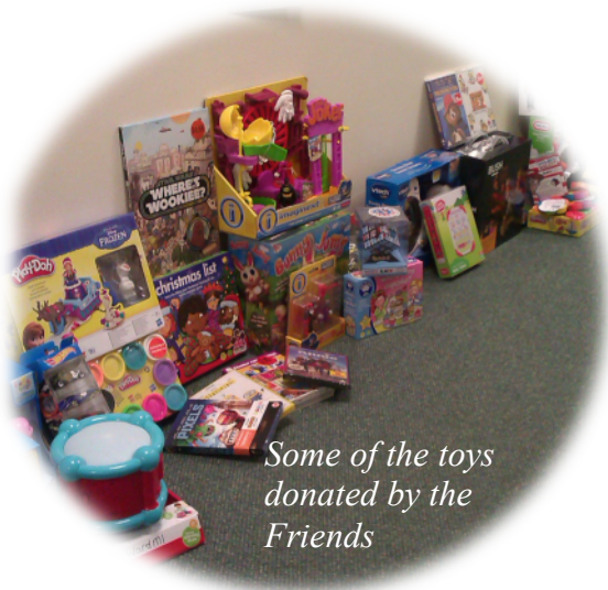
Some of the toys donated by the Friends

The main donations, out of over 30 made this year, were to the following departments: