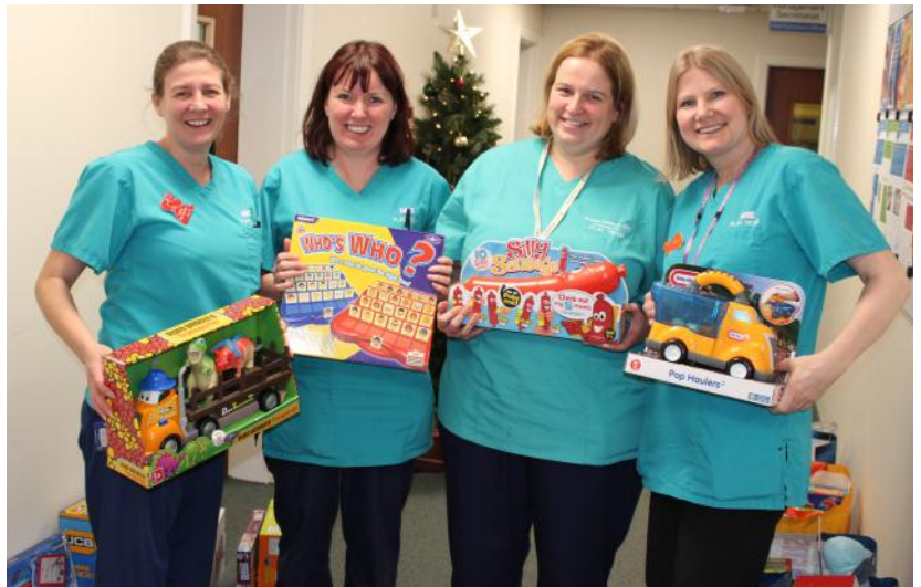
Staff with some of the Christmas toys for the Wards donated by the Friends